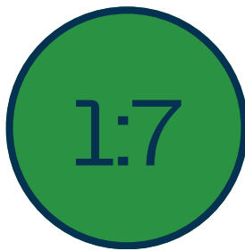
Student Teacher Ratio