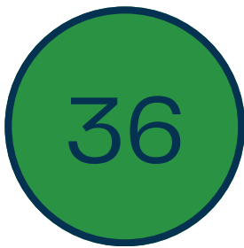
Number of Students Enrolled

We follow and support students and their families after graduation. Most students attend our sister and brother schools Grace Academy and Covenant Prep. and go on to excel at some of the region's most prestigious college preparatory schools. 100% of Trinity's first graduating class are on track to graduate high school.